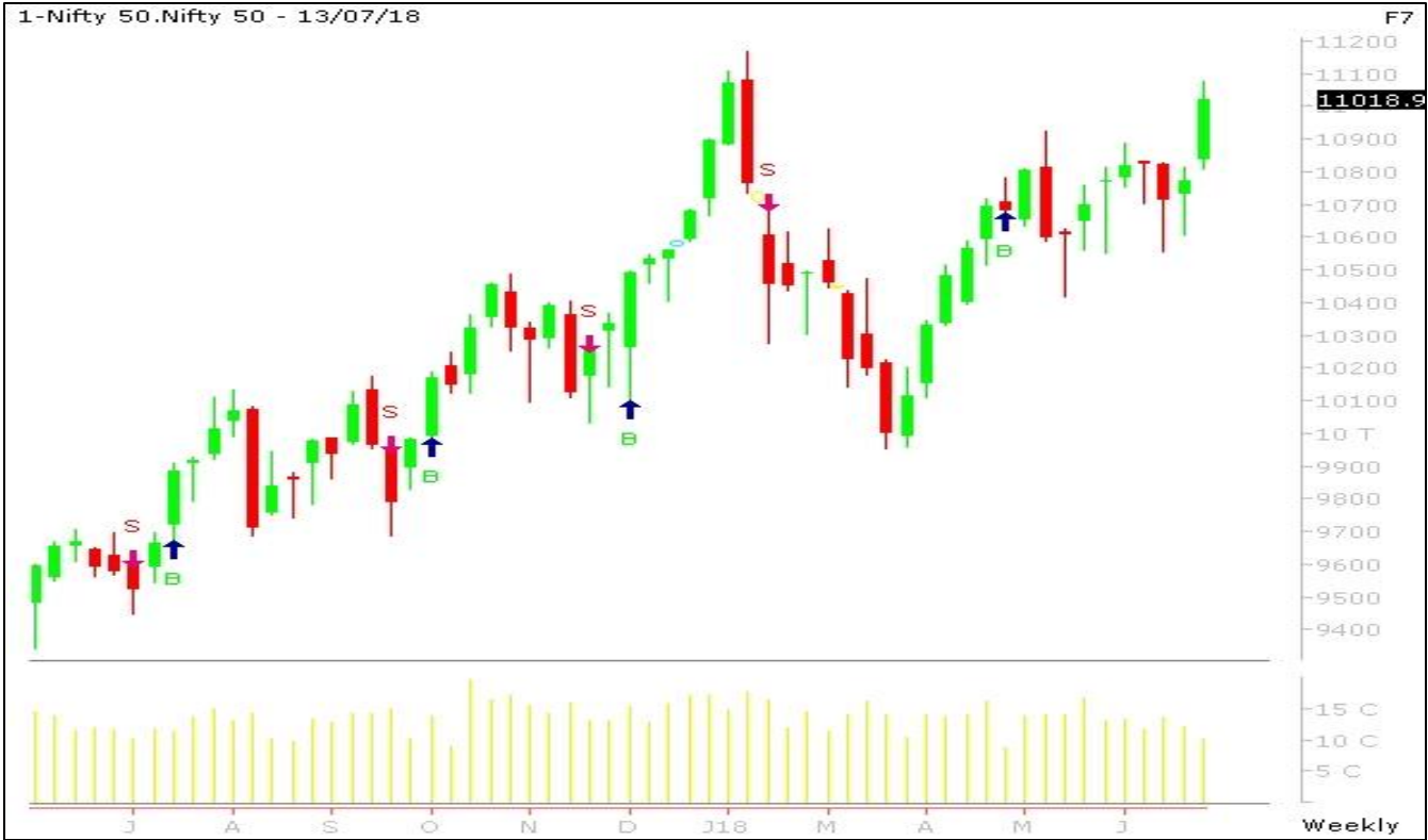
1-Nifty 50.Nifty 50 - 13/07/18